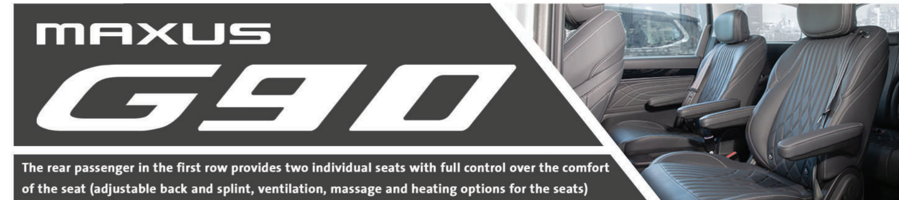
The rear passenger in the first row provides two individual seats with full control over the comfort of the seat (adjustable back and splint, ventilation, massage and heating options for the seats)