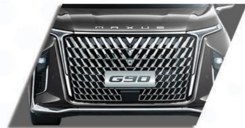
Large front grill made of chrome material with wide space helps in ventilation and cooling the engine