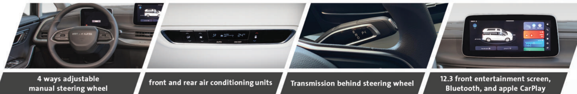
4 ways adjustable manual steering wheel