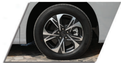
18 inch Aluminum Tiers