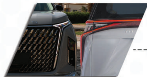
Front and Rear LED lights merged with the front grill in T shape