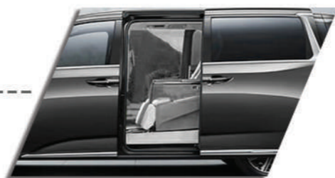
The right door slides electrically and the left door slides manually