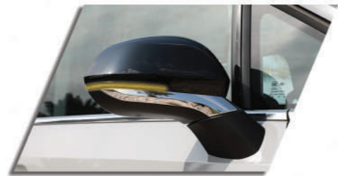
LED Turn signal side lights